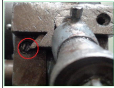
Screw loose & worn out